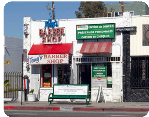
Canopies and awnings that extend into the public right-of-way may require a road encroachment permit.